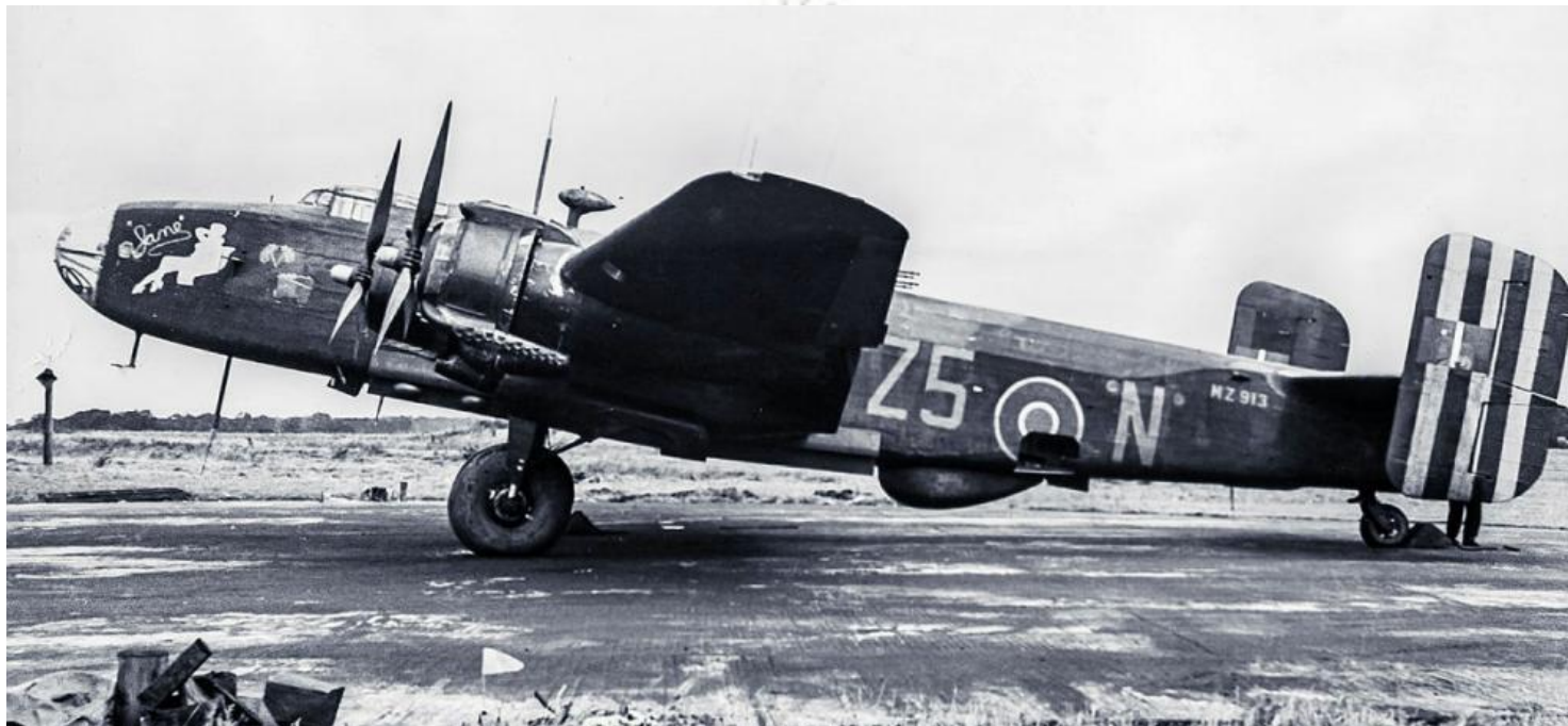
Halifax Bomber "Jane" – picture source unknown.